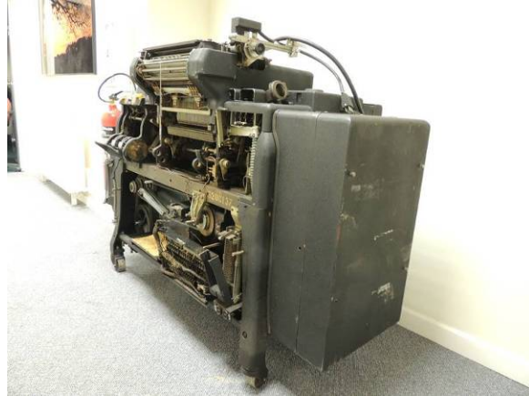
The 416 Tabulator stripped to door width