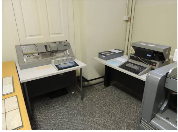
029 and 5496 from Oslo

Web Site: <a href="http://hursley.slx-online.biz/">http://hursley.slx-online.biz/</a> IBM Contact: <a href="http://hursley.slx-online.biz/">Hursley Communications</a> Curator Contact: <a href="http://peter.short">Peter Short</a>