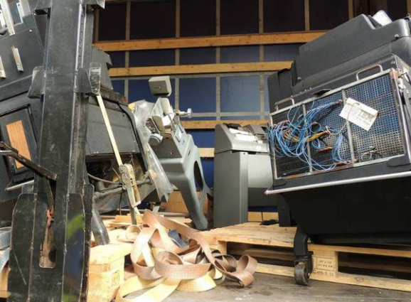
How not to ship heavy stuff