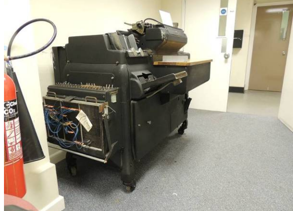
And back together again

Once everything had been unloaded, we three curators were left to move everything into the museum ourselves. By late afternoon we were somewhat knackered, and managed to seek some help to move the remaining machines into the stable block archway until after the weekend. On the Monday we received some help to get the remaining hardware inside. The 416 tabulator gave us an interesting problem. Not only had it lost a wheel, but it was also too wide to get through the door. Anything sticking out the front was removed, and it was wheeled in with millimetres to spare. Rolling a three-wheeled dead weight of several hundred kilos did provide some interesting moments!