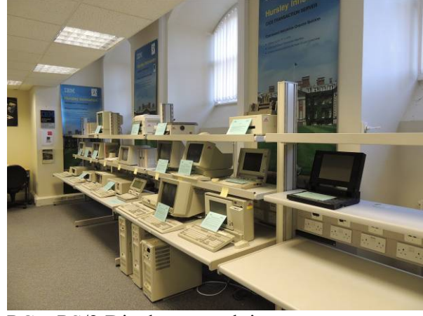
PC – PS/2 Display – work in progress

Meanwhile we have also embarked on some major reorganisation of the Personal Computing section. We recently acquired new, narrower shelving for the display tables that allow for three levels instead of two. The PC story now follows a timeline, so portables and ThinkPads are interspersed with PCs and PS/2s. The new display cabinet with the 'exploded' 701 Butterfly will be moved into the same room where more changes are planned – although we don't yet know what the plan is!